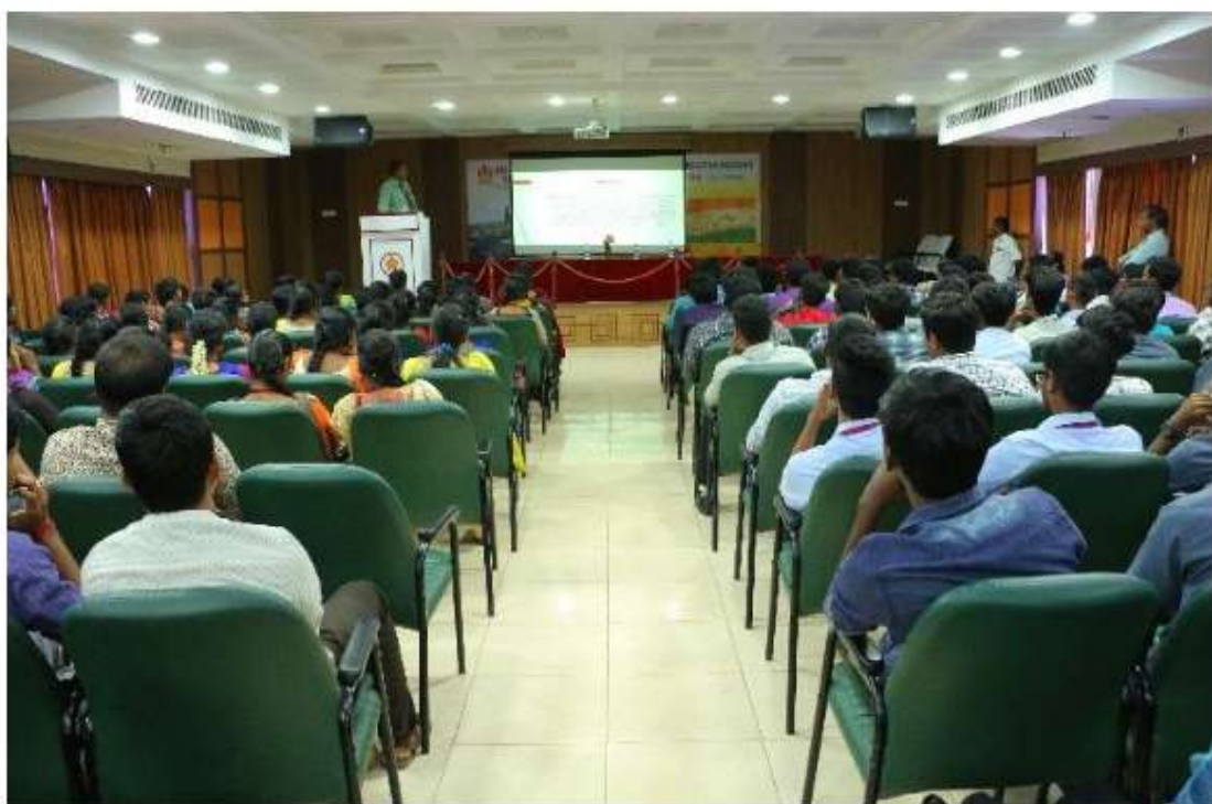
A view of the gathering